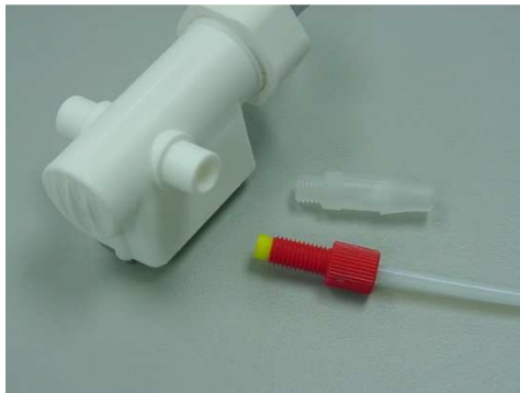
Example of ¼-28 UNF bottom sealing fitting (bottom) and face sealing fitting (top)